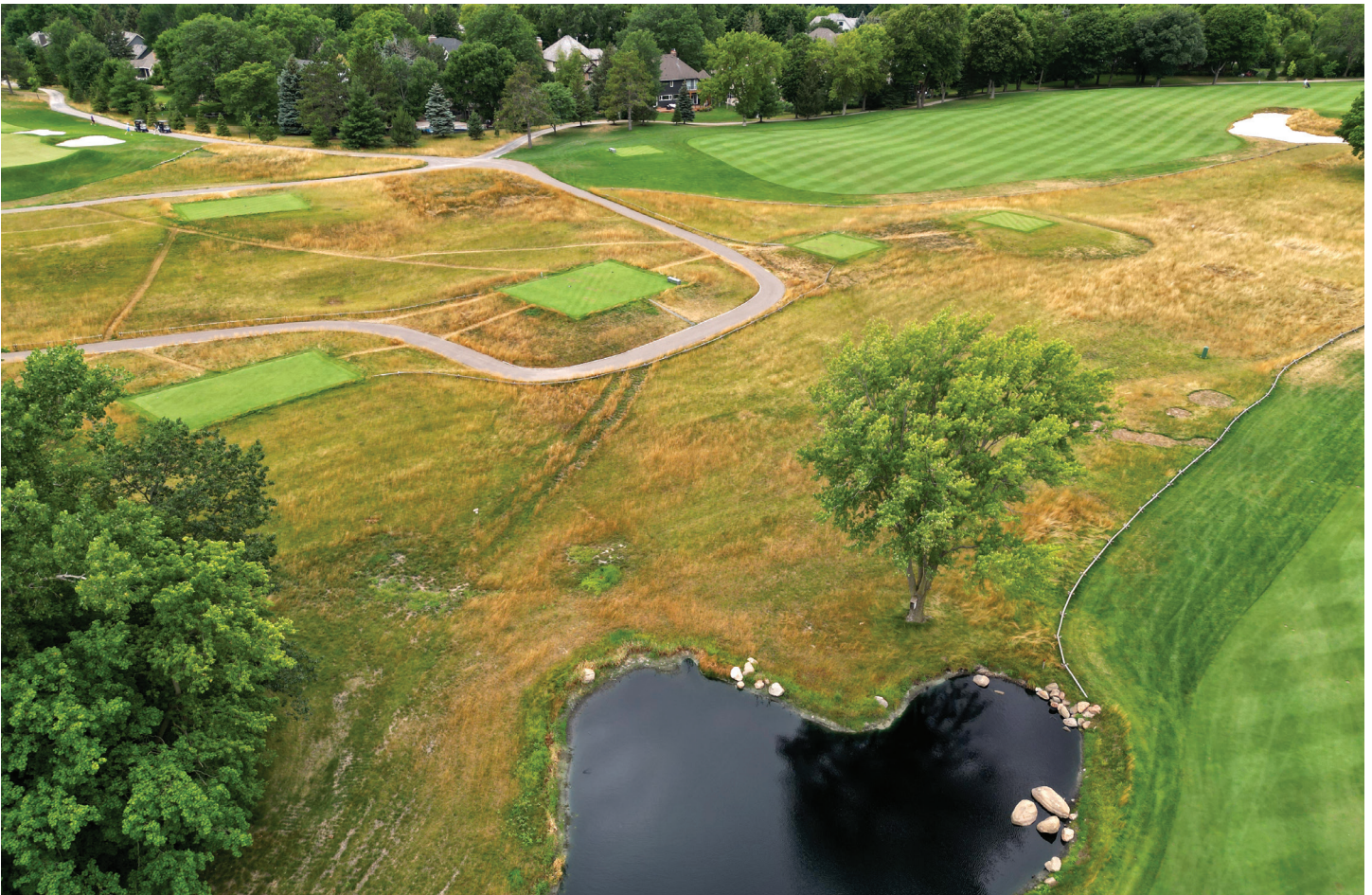
Areas between holes, around tees and along the property line are popular targets for turf reduction.

Reducing irrigated turfgrass acreage has been performed on golf courses across the U.S. Courses in the western U.S. often reduce irrigated acreage to decrease their water costs or focus a limited water supply on primary playing areas. Some areas of the West have incentivized courses to eliminate irrigated turfgrass with rebate programs. In areas where rainfall is more plentiful, creating naturalized areas is often part of architectural or aesthetic changes to a course – or part of an effort to focus more resources closer to the line of play.