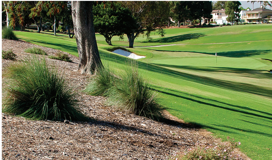
A mix of mulch and plantings can be a playable and attractive option for turf reduction areas.

Various sizes of rock and mulch are commonly used in turfgrass-reduction areas, especially in the Desert Southwest. In 2024, costs for this type of landscape rock spread 2 inches deep range from $18,000 to $25,000 per acre. The type of rock used is typically 0.375-inch diameter or less, and most often, courses use 0.125-inch diameter or less because it easily compacts and golfers can hit a recovery shot with relative ease. However, the small rock will erode with wind and water, especially when placed on slopes. Some courses have successfully used larger landscape rock or “rip rap” in these scenarios, but costs are significantly higher for the larger rock. Some courses in dry climates would rather repair erosion after the infrequent rain events rather than spend additional money on large rocks. Where water flows into the course from off-site, such as from homesites or streets, it is often best to use larger rock or leave these areas as turfgrass for erosion mitigation.