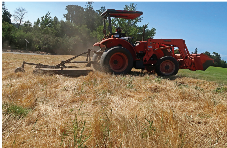
Mowing is an important part of managing naturalized grasses in turf reduction areas. If a course is having issues with density or weeds in these areas, more-frequent mowing may be the answer.

Turfgrass-reduction areas tend to be more problematic when they are too thick rather than too thin. Golfers may complain about poor coverage or erosion, but if they can find and play their ball the complaints are generally fewer. Unfortunately, the vegetation in turfgrass-reduction areas often gets too thick, leading to a poor aesthetic and lost balls. This is especially true in areas with regular rainfall and soils that retain moisture well. While the goal may be having long grass with seedheads visible throughout much of the year, a rainy stretch of weather can make turfgrass-reduction areas grow out of control, and there’s nothing wrong with mowing them down to more manageable heights. The desired contrast from rough areas will still be achieved, just with fewer complaints about weeds and lost balls. This same logic can apply to routine management. If resources can’t keep up with weed control and density management in non-irrigated areas, it might be better to just mow them at the highest possible height several times each year to keep things as playable and presentable as possible.